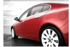
Automotive & Power